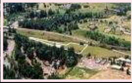
Site of North Bonneville Industrial Park

Recipient: Port of Skamania County Project Title: Fort Carson Industrial Site Plan Grant Award: $19,000 Time Period: May 2004 to January 2005