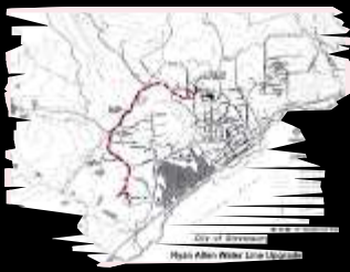
Ryan Allen Water Line Upgrade

The Port of Skamania County and Skamania County PUD were awarded funds from the state Rural Opportunity Fund to complete a Business Plan and Preliminary Feasibility Study for a high-speed, high-bandwidth fiber optic network in Skamania County. This work was the first step in accessing a 1,000-mile Tier I, fiber optic loop owned by the Bonneville Power Administration in the City of Stevenson. (Skamania County EDC administered the contract to assist the Port and PUD in these planning efforts.)