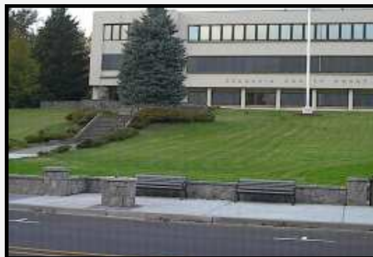
Skamania County Courthouse Lawn Improvements

Recipient: City of Stevenson Project Title: Water-line Extension Loan Amount: $50,000