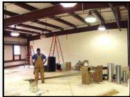
Mezzanine Work In Progress