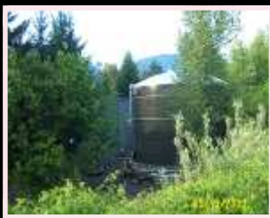
City of North Bonneville Storage System

The Port received financial assistance to remodel existing office space in the Tichenor Building. The remodel demolished some interior walls, doors and windows, and installed new systems; i.e., HVAC, electrical. Fiber optic cable was also installed from downtown to the Port's industrial area on the waterfront. (See also page 16.)