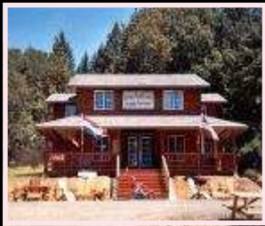
Wind Mountain Resort