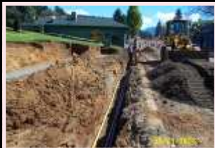
Laying Conduit for Future Telecommunications