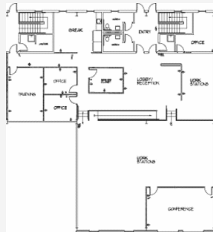
Sample of Marketing Materials Tichenor Building Floor Plan

The port received assistance to design and produce marketing materials to promote its industrial and business properties.