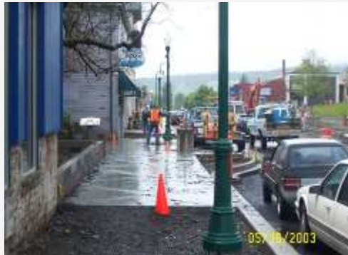
City of Stevenson Downtown Revitalization

Recipient: Skamania County Chamber of Commerce Project Title: Downtown Plan Grant Amount: $22,000 Time Period: October 1998 to April 2000