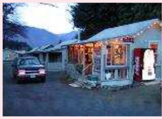
Sandhill Cottages Coffee Shop