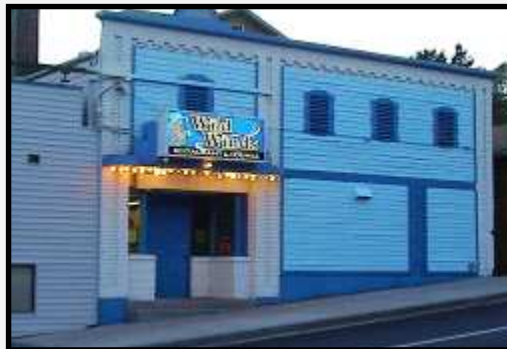
Wild Winds Restaurant & Lounge

In July 2003, the Washington Investment Board approved a restructure of this loan, and the business is now known as “Wild Winds Restaurant and Lounge.” An earlier loan enabled one partner to retain the business by purchasing the financial interest of the other partner. Terms of the restructured loan were satisfied in September 2007, and Wild Winds was closed. (See also page 6.)