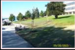
Landscaped Court House Lawn