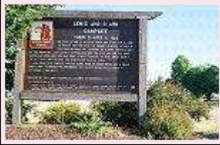
Commemoration of Lewis and Clark Campsite near Washougal