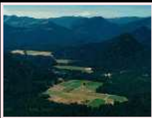
Wind River Nursery Site