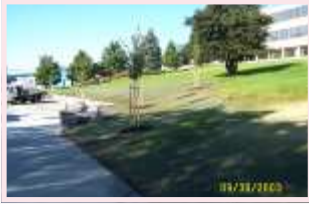
Landscaped Court House Lawn