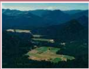
Wind River Nursery Site