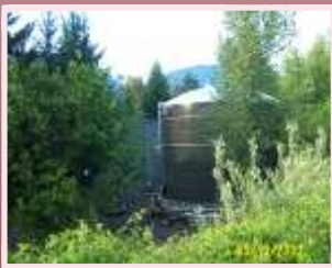
City of North Bonneville Storage System

The Port purchased commercial property between the Russell Street Tour Boat Dock and Leavens Street. This will enable the Port to further develop the waterfront.