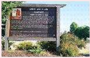
Commemoration of Lewis and Clark Campsite near Washougal

Recipient: Columbia River Gorge Visitors Association Project Title: Lewis and Clark Commemoration Grant Amount: $15,000 Leveraged: $20,000 Time Period: November 2002 to March 2003