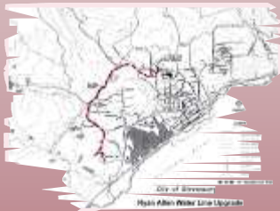
Ryan Allen Water Line Upgrade

The Port of Skamania County and Skamania County PUD were awarded funds from the state Rural Opportunity Fund to complete a Business Plan and Preliminary Feasibility Study for a high-speed, high-bandwidth fiber optic network in Skamania County. This work was the first step in accessing a 1,000-mile Tier I, fiber optic loop owned by the Bonneville Power Administration in the City of Stevenson. (Skamania County EDC administered the contract to assist the Port and PUD in these planning efforts.)