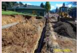
Laying Conduit for Future Telecommunications