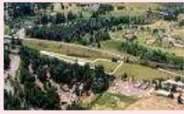
Site of North Bonneville Industrial Park

Recipient: Port of Skamania County Project Title: Fort Carson Industrial Site Plan Grant Award: $19,000 Time Period: May 2004 to January 2005